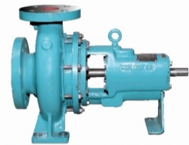
Zero Leakage Mechanism